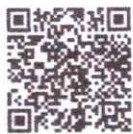
CSCROB Online Customer Feedback Form