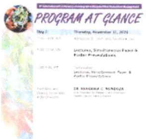
8th ICIDRRM 5.jpg 86K