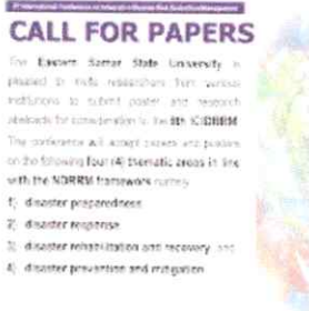
8th ICIDRRM 2.jpg 96K