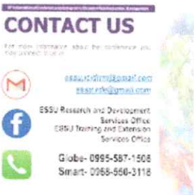
8th ICIDRRM 3.jpg 89K