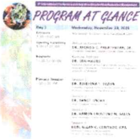
8th ICIDRRM 4.jpg 114K