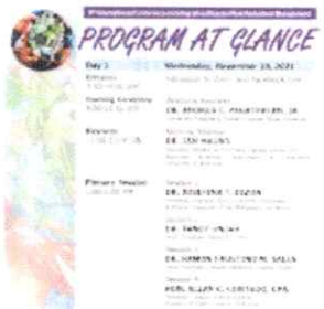
8th ICIDRRM 4.jpg 114K