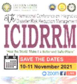
8th ICIDRRM 1.jpg 125K