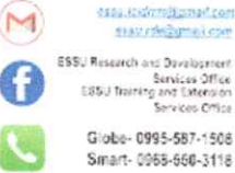
8th ICIDRRM 3.jpg 89K

For more information about the conference, please contact us at: