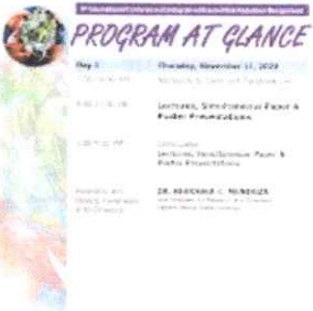
8th ICIDRRM 5.jpg 86K