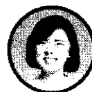
Dr. Beverly Lorraine Ho DEPARTMENT OF HEALTH DIRECTOR OF THE DISEASE PREVENTION AND CONTROL BUREAU AND THE HEALTH PROMOTION BUREAU