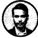
Atom Araullo FYT CO-FOUNDER AND BROADCAST JOURNALIST