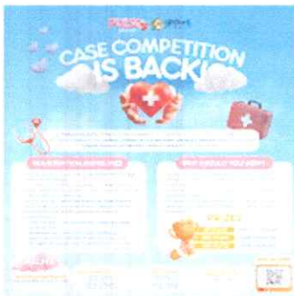
UP Medical Convention Poster.jpg 869K

[ENDORSEMENTS & ADVISORIES] Medcon 2024.pdf 19299K