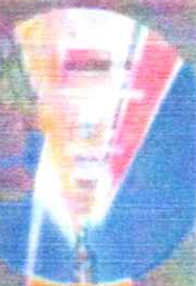
Villa Mercedes Private Resort