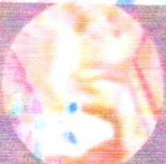
Hotel Wynn Las Vegas