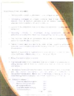
FFP24 Dance 3.jpg 119K