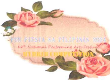
FFP24 Layout 1.jpg 106K