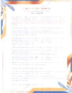
FFP24 Guidelines.jpg 136K