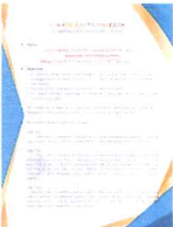
FFP24 Theme & Objectives.jpg 110K