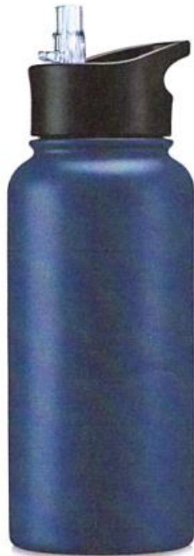
1L Thermal Bottle