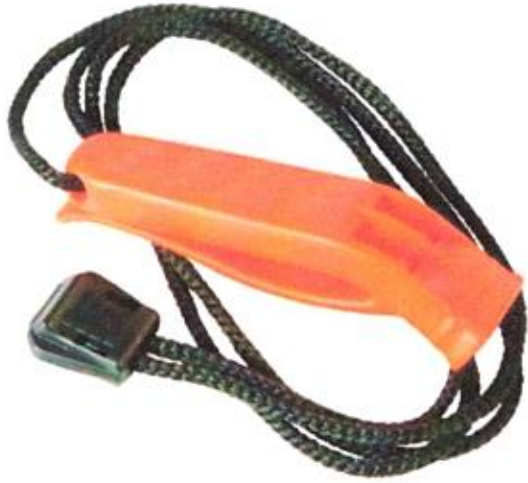
Heavy Duty Whistle